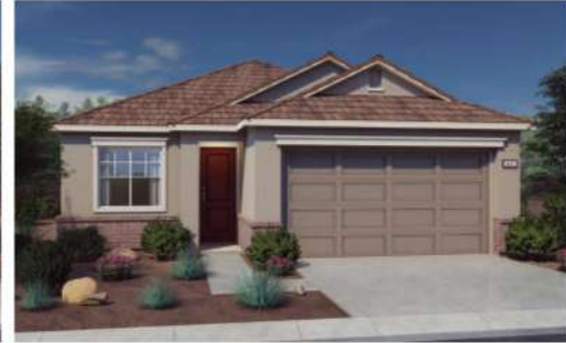
PLAN 1C | SCHEME 7