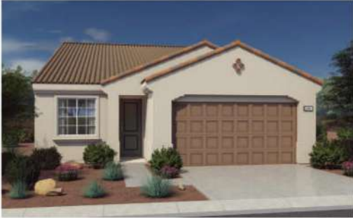
PLAN 1A | SCHEME 1