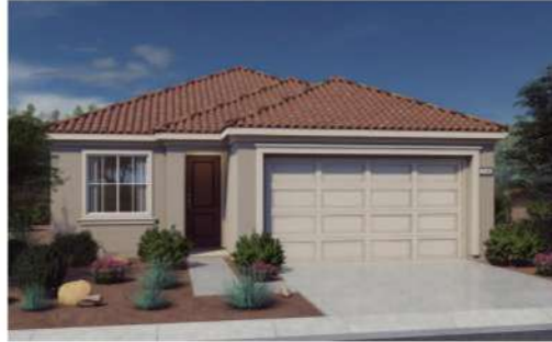
PLAN 1B | SCHEME 4